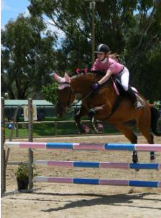
The Pink Rug and Sash Winner